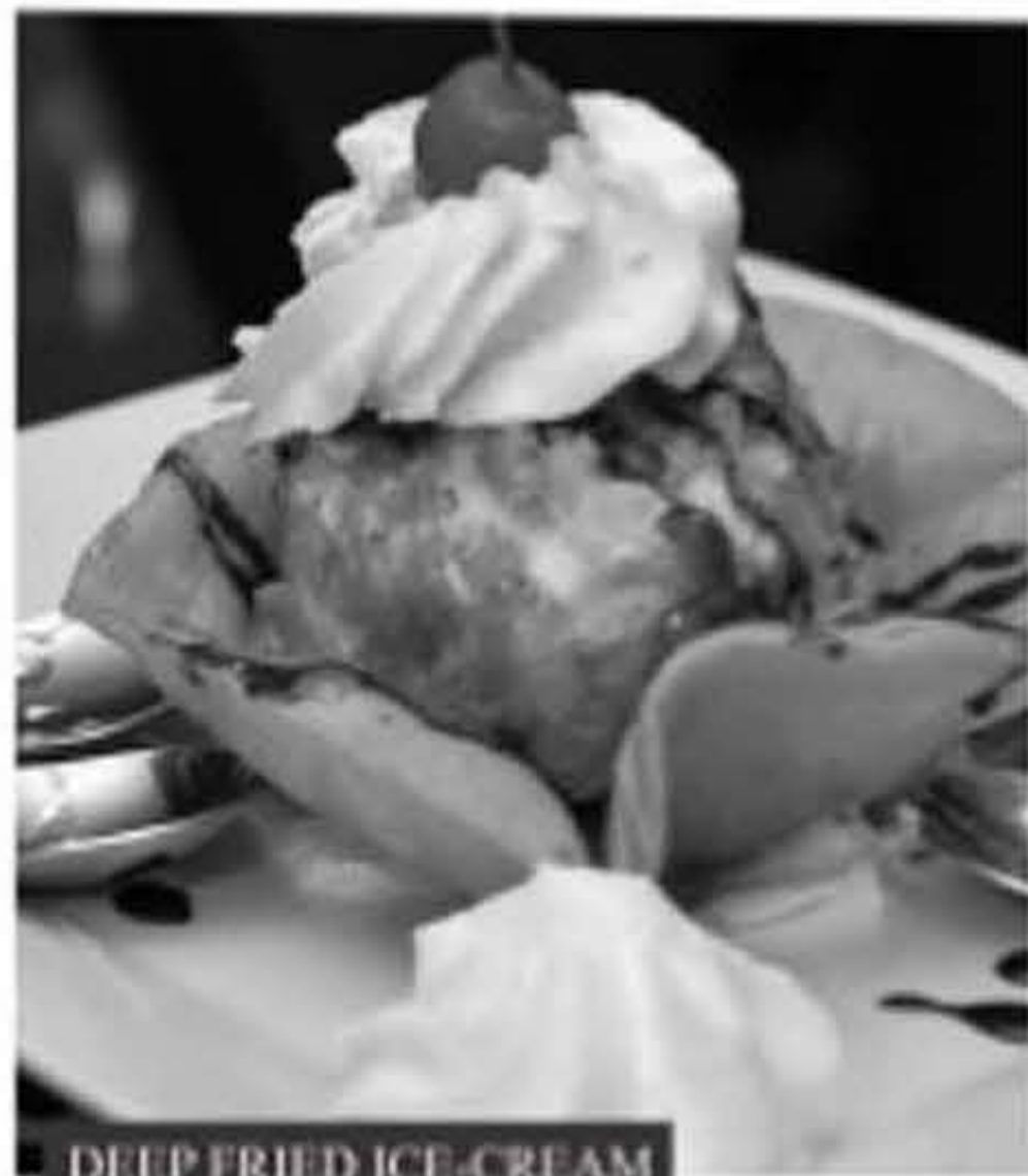
DEEP FRIED ICE-CREAM