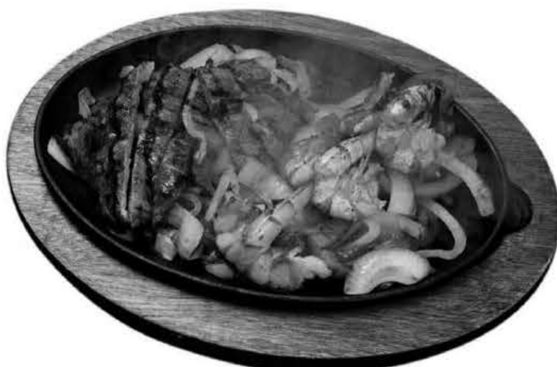
Steak & Shrimp Fajita